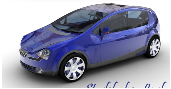
Studebaker Motor Company Lark Concept

https://www.foxnews.com/auto/colorado-man-plots-return-of-studebaker