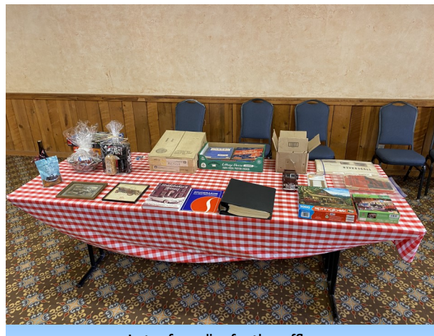
Lots of goodies for the raffle