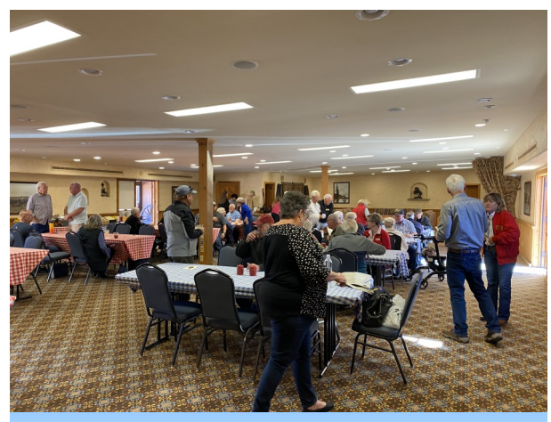
A nice room for the event