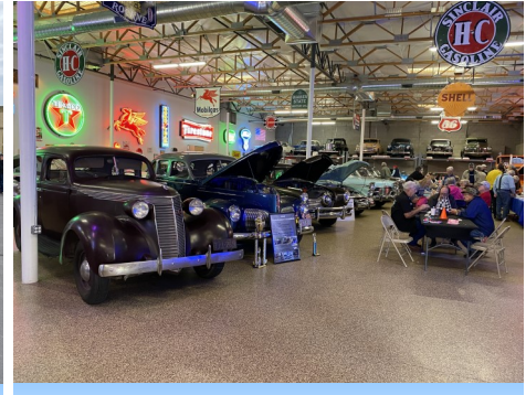
Some of the cars that made it to the event