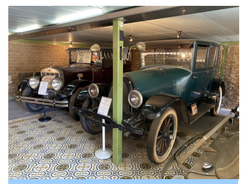
The museum has an unusual security lock for it's 1923 Franklin Raulang Coupe (Must be valuable)