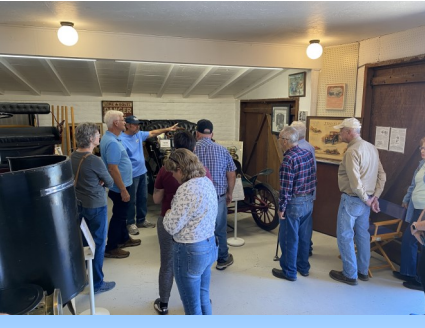
Our tour guide expertly enriching us with Franklin history and tidbits