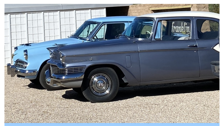
Who are we trying to fool with "Franklin" in the window! These are Studebakers!