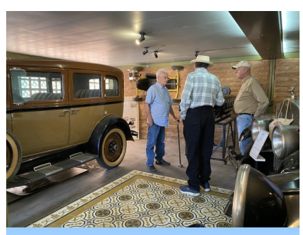
Discussing a Franklin Aircraft Engine