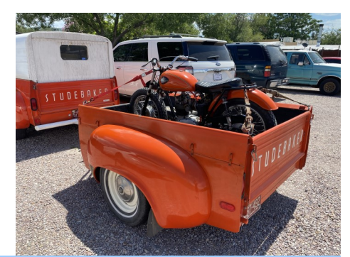
Lou Fencl's '56 Transtar towing a custom Studebaker trailer with a BSA motorcycle, all matching beautifully