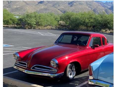
Gary Spies' 1953 Coupe