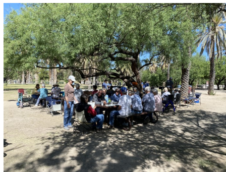
A beautiful morning

*See the other Studebakers that made the trip on the back page*