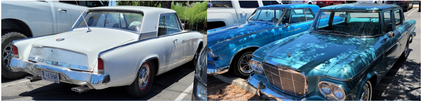
Some nice cars could be seen outside the restaurant