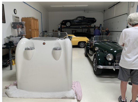
Wait one minute - These aren't Studebakers