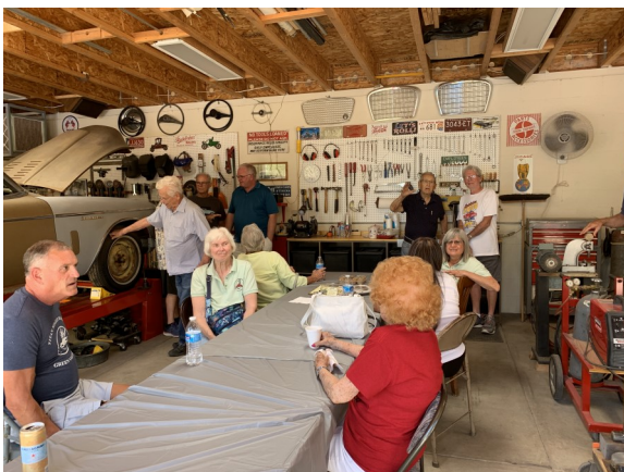
Randy's Play Room