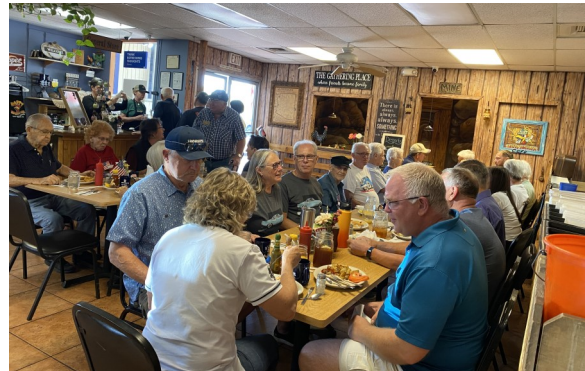
Delicious food and great conversation