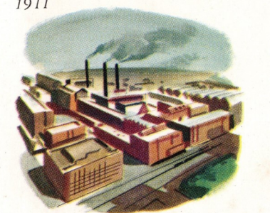
From $68 to this in 59 years The hour of decision arrived in 1911. Studebaker erected and equipped huge factories for automobile production. The Studebaker Corporation with 8000 employees, 1500 dealers, $23,000,000 in tangible assets was formed.