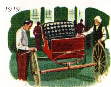
End of the line and an era Horse-drawn Studebakers were discontinued as vast new Studebaker car and truck plants opened up. Studebaker hit new highs in output-had the biggest percentage of increase in its industry from 1919 through 1923.