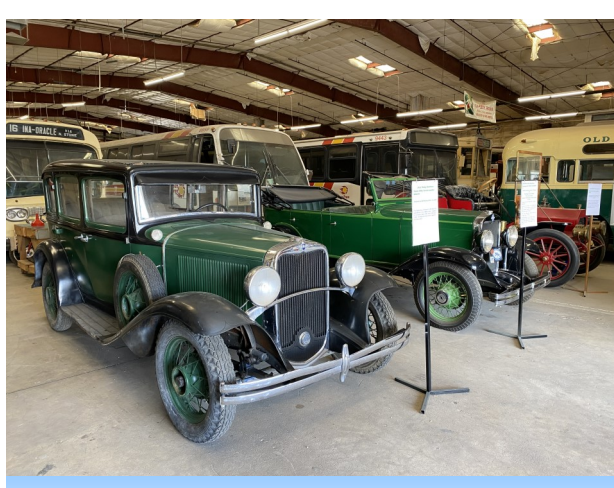
Three antique cars greeted us as we walked in.