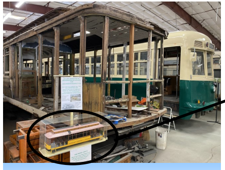
A 1911 trolley starting restoration