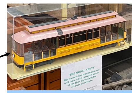
A custom made model of how the trolley will look when restored