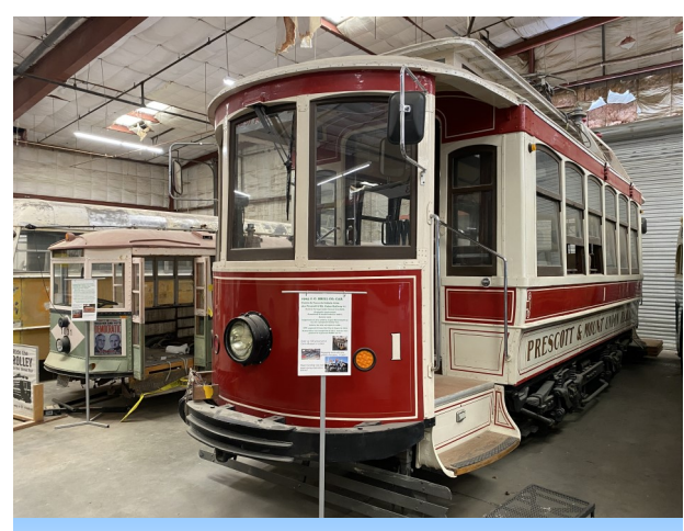
The editors favorite — A 1925 J. G. Brill Co. Car built in Portugal