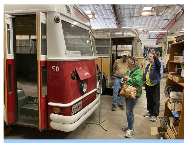
Checking out a 1946 Ford Transit Bus