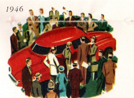
First by far with a postwar car A daring change for the better in automobile styling was introduced-ready just nine months after World War II stopped. The car -the trim, sleek, "new look" Studebaker. All modern car design reflects its influence.