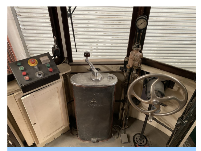
The Controls for the Brill Co. Car (It has identical controls at the opposite end)