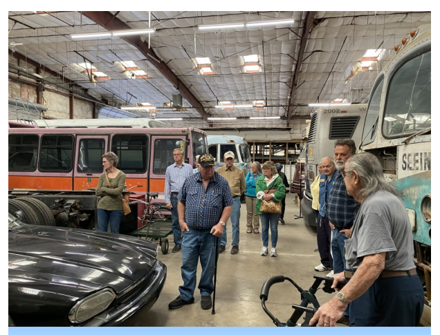
So much to see