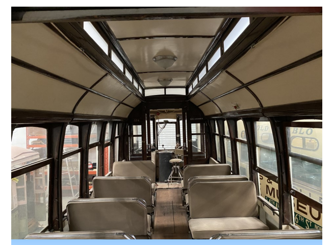
Inside the Beautifully Restored J. G. Brill Co. Car