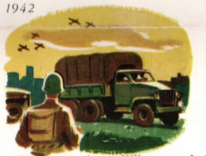
Bomber engines! Military trucks! World War II saw Studebaker busy building over 63,000 engines for the Flying Fortressnearly 200,000 military trucks-some 15,000 tracked amphibious vehicles called Weasels, powered by Studebaker Champion engines.