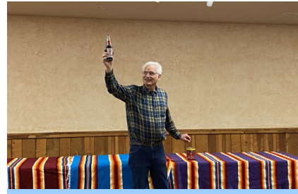
Pitching the Studebaker auction items