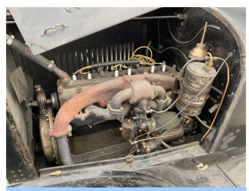
The fuel pump (on the right) is vacuum driven