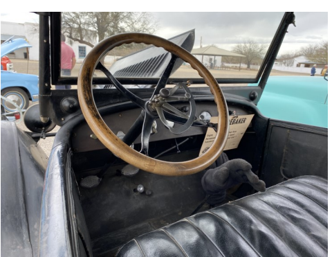
The throttle and timing adjust are on the steering wheel