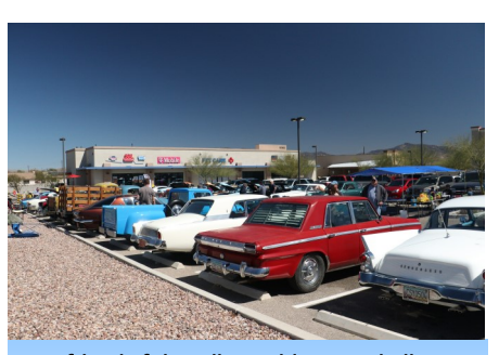
A friend of the editor said "I can't believe how many beautiful cars there are, and the variety"