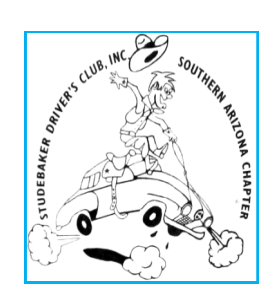
THE COPPER STARTIGHT OF THE SACCETA PASTURA VAIL, ARIZONA 85641