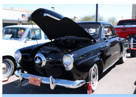
Winner of the People's Choice