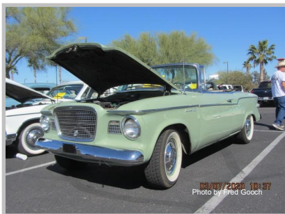
Hubert Adam's '60 Lark Convertible