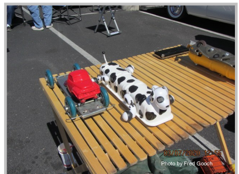
Colorful Valve Cover Cars