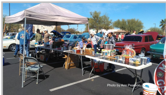
The Raffle Table