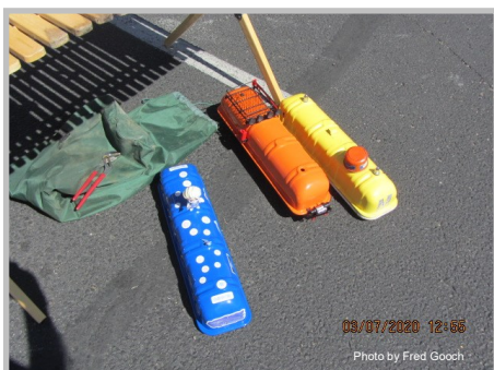
Colorful Valve Cover Cars