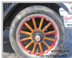
Lou Fencl's 1923 Studebaker wheel

The valve cover racing was especially fun for the kids. All ages were laughing and smiling as the races proceeded. Little children were running and trying to out race the cars, and winning!