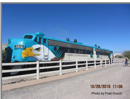
10/28/2018 11:09