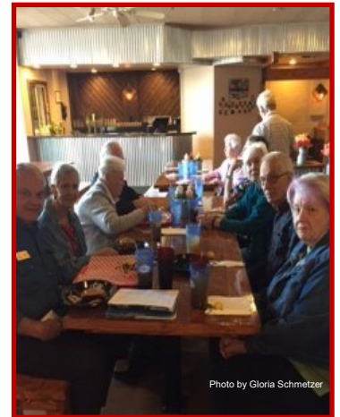
Discovering another new restaurant!