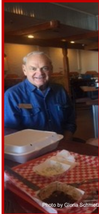
John L. Lewis