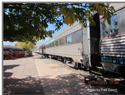
10/26/2019 11:04