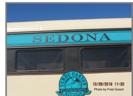
10/28/2018 11:20