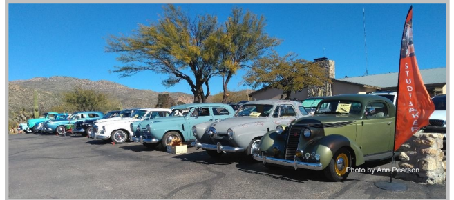
The Line Up!

On Sunday, January 19, 2020, 66 members and friends attended the annual Southern Arizona Chapter Banquet at the Tanque Verde Ranch. We had such a nice turn-out! The food was delicious and the wait staff was especially helpful.