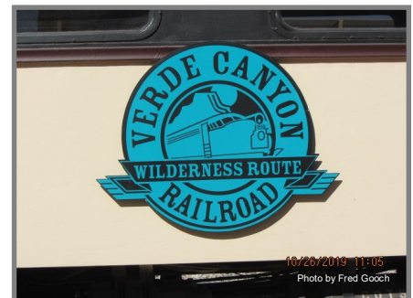
10/26/2019 11:05