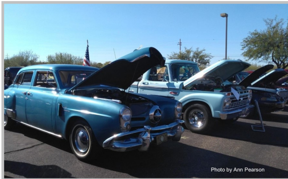
1950 Studebaker Land Cruiser owned by John L. Lewis