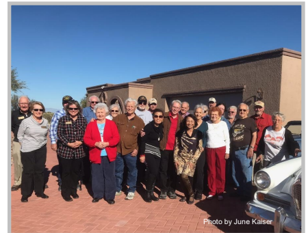
A Happy Group and a Time to Remember!