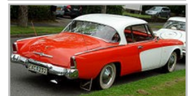
Studebaker Starliner Coupe