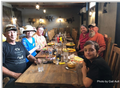
Bring on the Food!