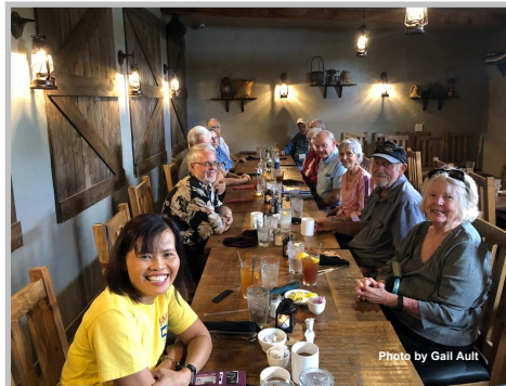
A Happy Group!